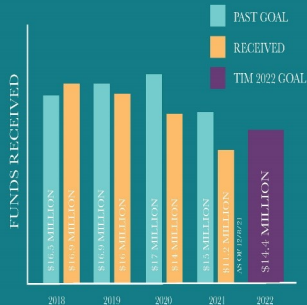
"LET US PRAY, LET US PERSEVERE, LET US BELIEVE."

In 2022, please help us renew our sense of unity and make a generous gift today! Your support gives our struggling parishes and schools much needed hope.