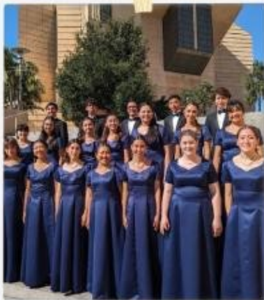
Cathedral of Our Lady of the Angels