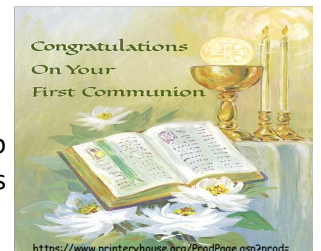
Congratulations On Your First Communion

We ask for your prayers as they continue forward in their spiritual journey with Our Lord!